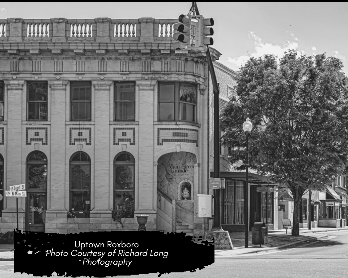
Uptown Roxboro