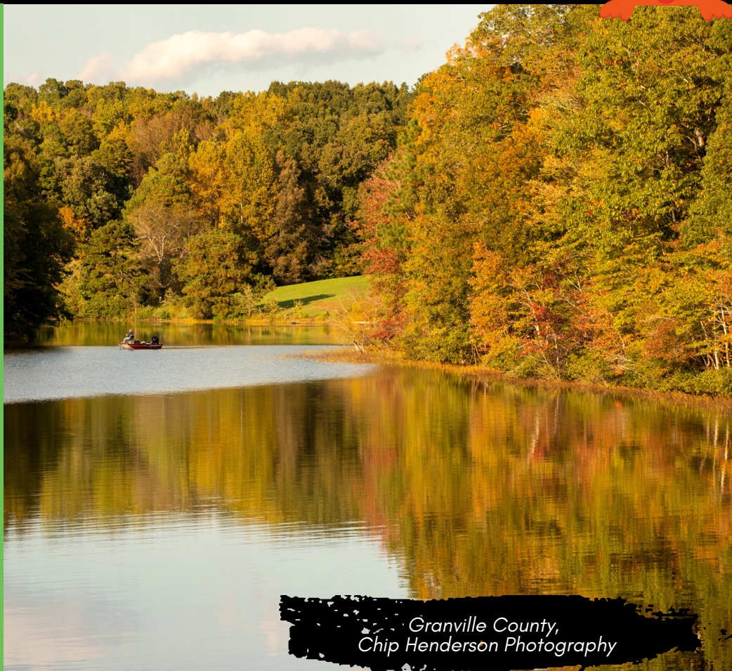
Granville County